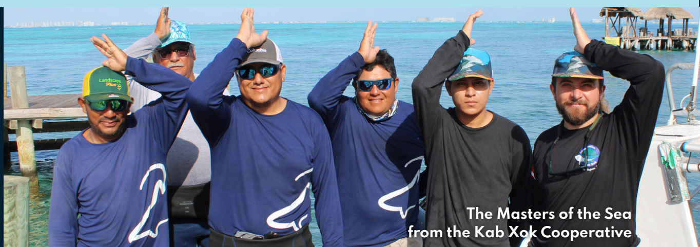
The Masters of the Sea from the Kab Xok Cooperative

SHARK SAFARI ISLA MUJERES SHARK INITIATIVE